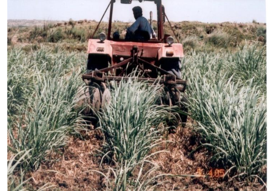
■ B) Soil cover application/trash blanket